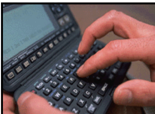
"Manage your schedules."

If there are any topics that need attention that have not been discussed in this mailing, please advise vctickles@yahoo.com . Thanks!